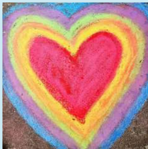
Sidewalk Chalk Art