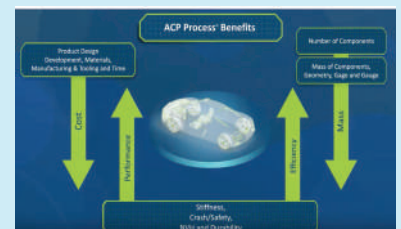
ACP Process Benefits