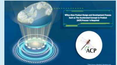
Why the ACP Process?