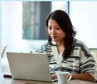
Stay safe and connected while working from home.